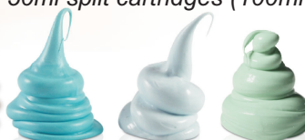
Blu-Mousse Blu-Mousse 60 Green-Mousse